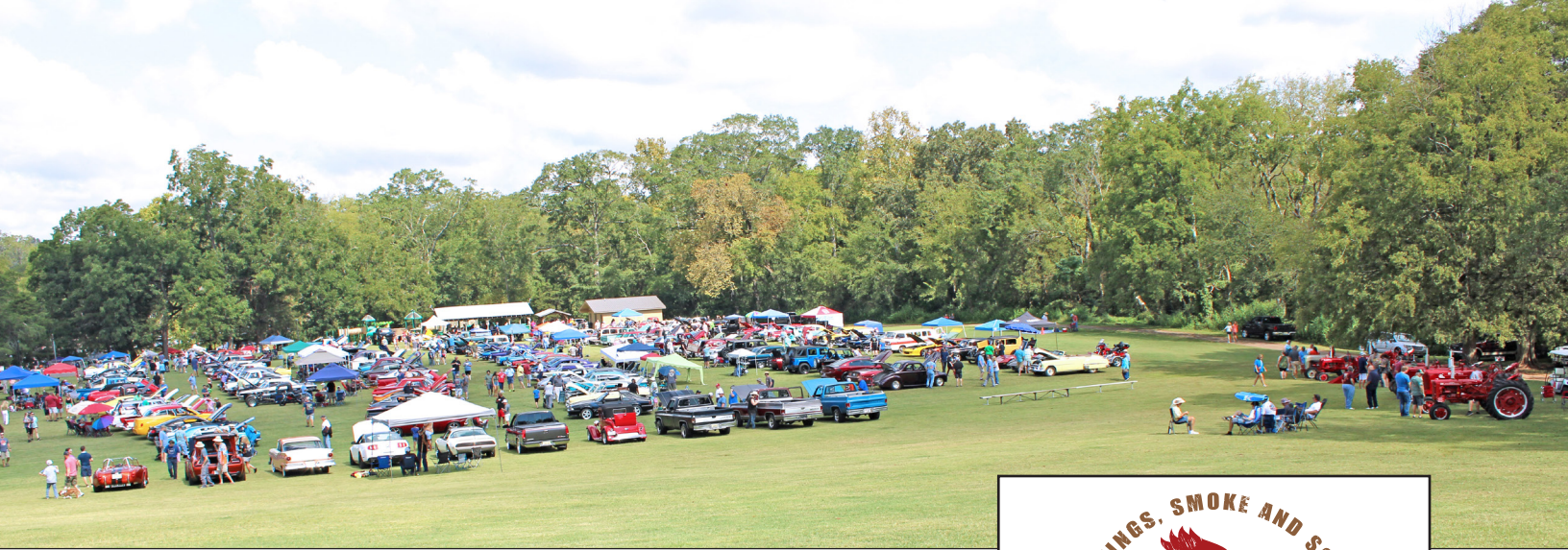
“Cars by the Creek” attracted more than 100 classic cars while “Tractors in the Trees” made a strong showing at this year’s festival on September 7, 2024.